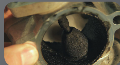
A clogged EGR valve can severely restrict the air flow causing incorrect air fuel ratios & loss of power

Make Wynn's Diesel Fuel System Service part of your regular maintenance schedule