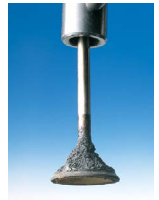
Dirty Intake Valve